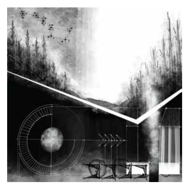
Digital Working Sketch by Celina Brownotter, 2024.

LOS ANGELES — We Carry the Land is an architectural exploration of space, time, and form born from an alignment of varied Indigenous foundational ways of being, designed and installed by Materials & Applications (M&A) in the Craft Contemporary Courtyard. Rooted in the sacredness of the natural world and informed by experiences of territorial geographic relocation, the project presents a spatial identity of what it means to be a part of the Indigenous diaspora; grounded, yet simultaneously flexible. The exhibition will be on view from May 26 - September 8, 2024.